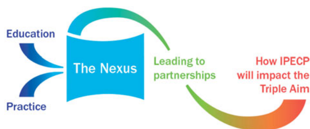
Figure 1. The national center vision.